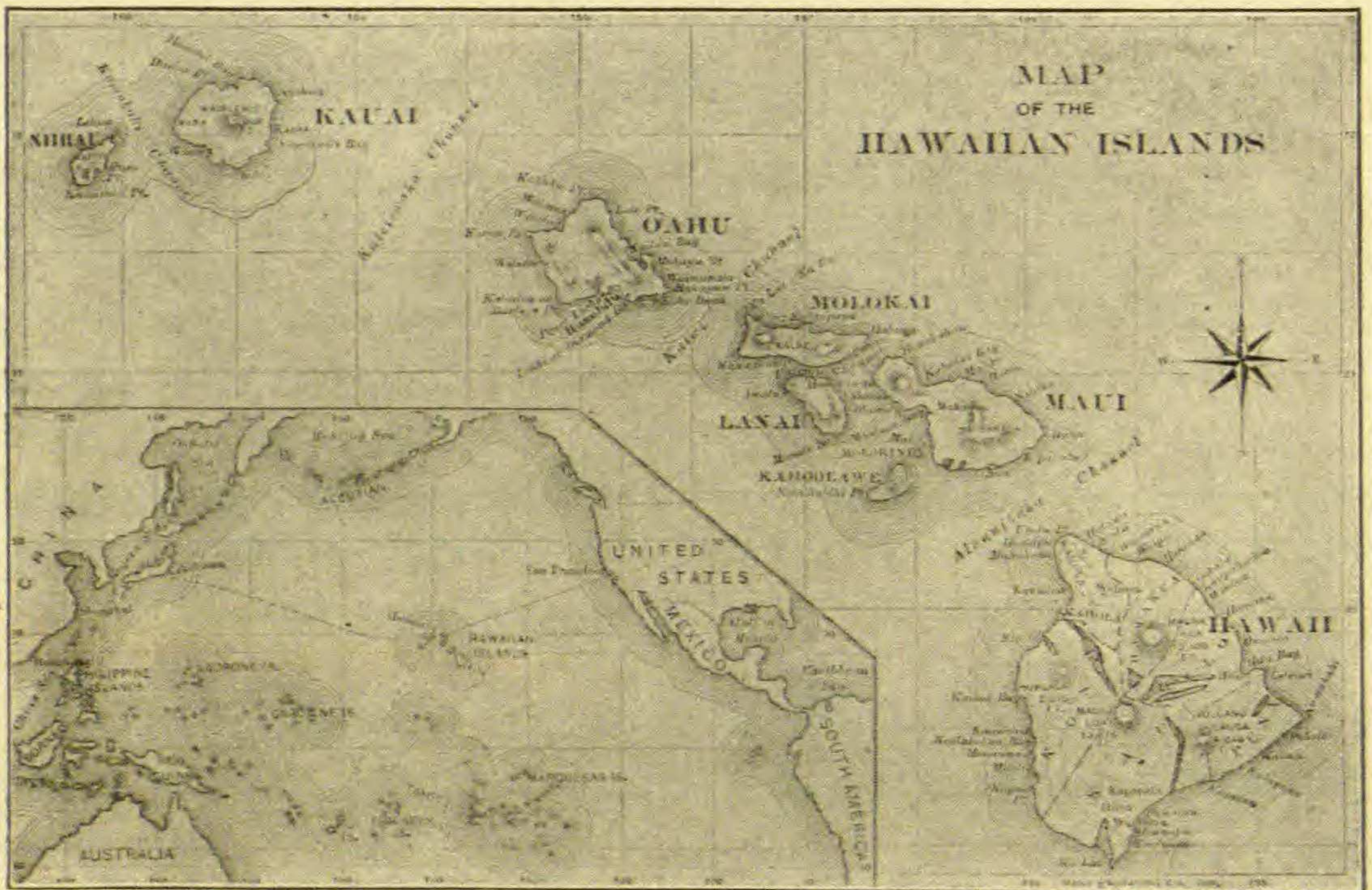
FIG. 1.—Map of the larger islands of the Hawaiian Archipelago

For an account of the physical aspects of the Hawaiian Islands, their topography, climate, volcanoes, soils, and geological history, all of which have important and complicated relations with the flora, the reader is referred to such standard treatises as BALDWIN'S Geography of the Hawaiian Islands , BRYAN'S Natural history of Hawaii , HITCHCOCK'S Volcanoes of the Hawaiian Islands , and the excellent article on Hawaii in the latest edition of the Encyclopedia Britannica .